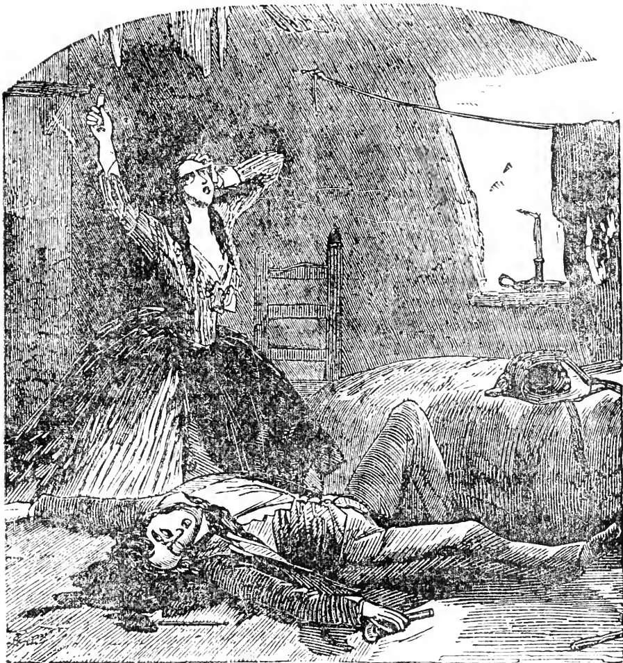
THE OUTLAW SHOT IN HIS CABIN.

to the spot where the outlaws disappeared into the swamp and fired, and the same evening the Lumberton militia took to the swamps, twenty-five in number, and stayed out all night.